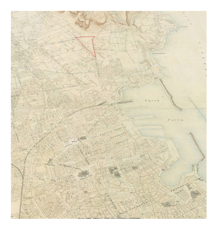
Fig. 1. Palermo, 1935. (drawn by the authors)

Before exploring the pandemic and post-pandemic Fiera del Mediterraneo landscape, we want to trace the history of this fragment of Palermo. At the end of the 18th century, in the large Northern area of the city, which is the subject of our case study, an urban sprawl started and changed the face of this area in little more than a century. Numerous industrial plants sprang up and changed the urban function. However, the vast plain below the Monte Pellegrino was always used for military exercises and pasture. The Piazza del Campo, the wide esplanade on which the Fiera del Mediterraneo was to be built, was excluded from this housing development activity. Turning to visions and looking at the historical maps, the triangle of the future fairground (83,000 square metres) is clearly visible (Fig. 1).